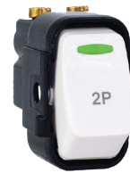
LI663-P / II663-P