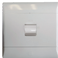
I129-P / I131-P